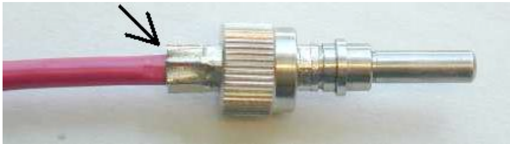
SMA termination with boot removed

The arrow in the lower picture marks the point where the jacket enters the connector. At some point inside the connector the jacket ends, at which point it must be sealed. In high-quality commercial cables the connector is typically filled with epoxy, encapsulating the jacket and providing an adequate seal. However since the seal is internal the only way to be sure is to consult the manufacturer.