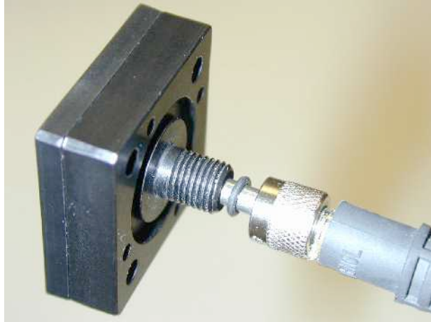
Inserting SMA connector with small o-ring in place

To provide a water seal, place a 3mm-internal diameter, 1mm wide o-ring around the end of the cable's SMA ferrule, as shown in the photograph below, before screwing it into place. For best results, tighten the connection by holding the end of the cable stationary rotating the collector . This help to work the o-ring into its groove without pinching it. The connector should be hand-tightened (rather than using a wrench) to avoid stripping the plastic threads.