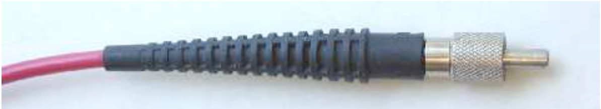
SMA termination with boot

The most likely entry point for water is where the cable's outer jacket enters the fiber optic connector. This is normally covered by a strain-relief "boot" as shown below. This boot may or may not form a seal by itself.